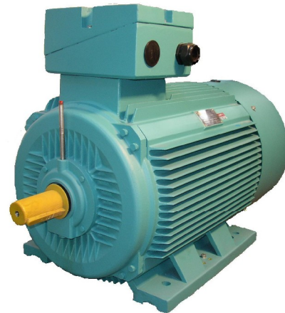
Y2 CAST IRON RANGE